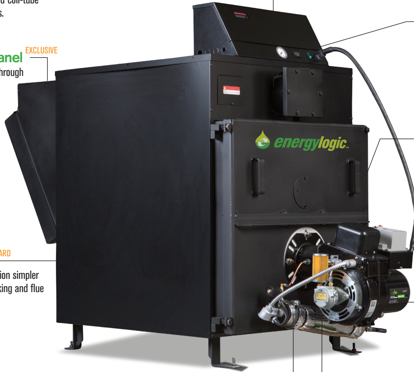
Pictured: 375B boiler

Rapidly heats the widest range of viscosities of used oil, synthetic oil and other acceptable fuels.